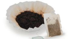
Coffee Filters & Tea Bags