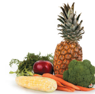
Fruits & Vegetables