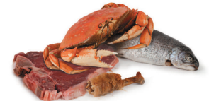
Meat, Fish, Shellfish & Bones